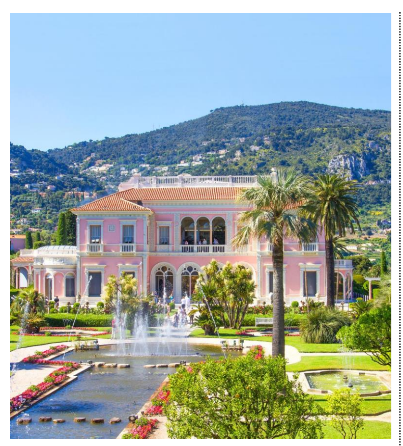
12 Days ● 18 Meals: 10 Breakfasts, 2 Lunches, 6 Dinners

HIGHLIGHTS... Nice, Food Tour & Tasting, Nice Flower Market, Monaco, Monte Carlo, Choice on Tour: Monte Carlo Panoramic Tour or Monaco's Oceanographic Museum, Grasse, Fragonard Perfumery Workshop, Cannes, Saint-Honorat Island & Wine Tasting, Villa Ephrussi de Rothschild, St. Paul de Vence