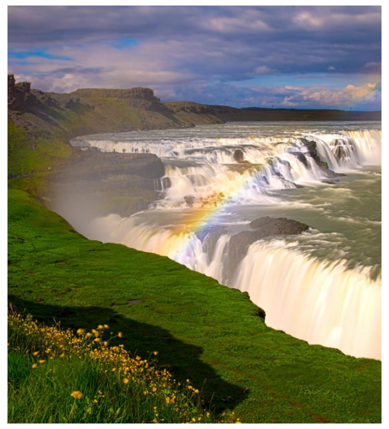
10 Days • 15 Meals: 8 Breakfasts, 2 Lunches, 5 Dinners

HIGHLIGHTS... Reykjavík, Golden Circle, Thingvellir National Park, Gullfoss, Geysir, Akranes, Breidafjördur Bay Cruise, Lava Exhibition Center, Vík, Skógar Museum, Skógafoss, Jökulsárlón Glacial Lagoon, Vatnajökull National Park, Seljalandsfoss, Choice on Tour: Blue Lagoon or Perlan Center