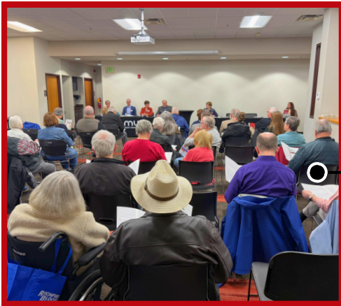
69 th Annual Meeting – 51 members in attendance at Richfield Branch

Scholarship Committee thanks everyone who applied this year. It was one of the strongest fields they have seen in many years! Lots of amazing young adults representing MY CREDIT UNION very well!