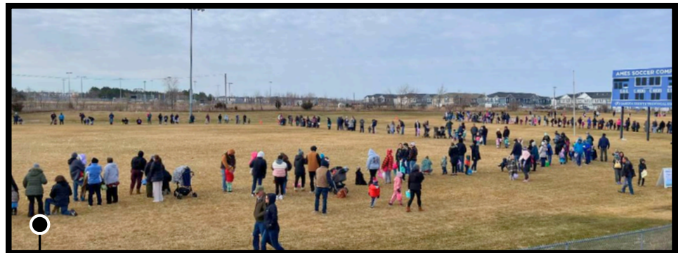
Rosemount Spring Egg Hunt – Hundreds of Rosemount braved chilly conditions in pursuit of eggs!