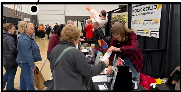
Bloomington Senior Expo – It was fun to talk to so many MY CREDIT UNION members who visited our booth. Many were Adventure Club members or TruLync Medicare Advisor clients of MY CREDIT UNION.